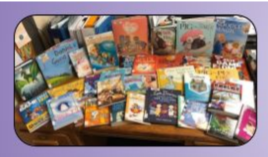
A big 'Thank You' to the PTO for donating several books from the book fair to the library!

Ideas, comments or questions? Share them with the PTO at: <a href="mailto:cbpto@outlook.com">cbpto@outlook.com</a>