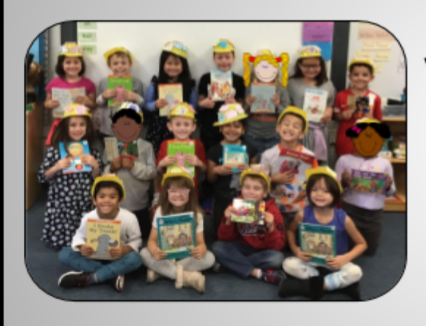
We completed our first reading unit, readers build good habits, and celebrated by decorating our construction hats with those good habits.